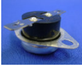
Type 03EP / 54N